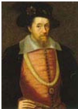
King James I