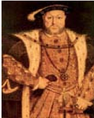
King Henry VIII

martyrdom. Cranmer's Bible, published by Coverdale, was known as the Great Bible due to its great size: a large pulpit folio measuring over 14 inches tall. Seven editions of this version were printed between April of 1539 and December of 1541 .